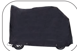
Scooter & Power Wheelchair Cover