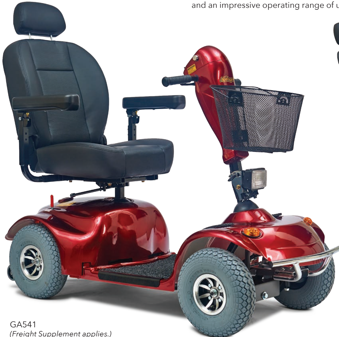
GA541 (Freight Supplement applies.)

When you want a rugged, heavy duty scooter to tackle the great outdoors, look no further than the Golden Avenger TM . It features oversized tires with sporty mag wheels, a full-size captain's seat for all day riding comfort, and an impressive operating range of up to 18 miles.