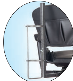
Oxygen Tank Holder