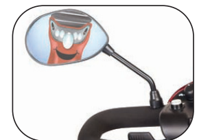
Rear View Mirror