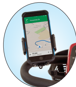
Cell Phone Holder