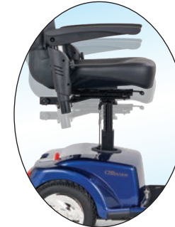
Power Elevating Seat*