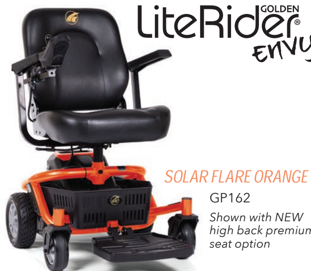
GP162 Shown with NEW high back premium seat option

The Envy offers a Dynamic LiNX controller that comes standard and the traditional style makes driving simple and reliable. The Envy, featuring two 22 Amp hour batteries for an operating range of up to 15.5 miles, is Golden's Retail Cash Power Wheelchair!