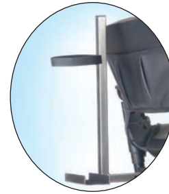
Quad Cane Holder