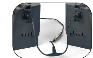
Y Cable Charging Harness