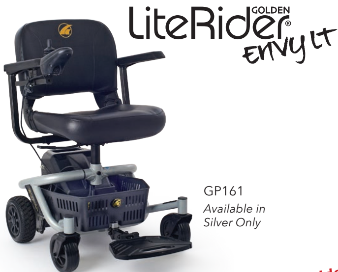
GP161 Available in Silver Only

The NEW Envy LT features a compact controller and well-styled joystick designed to make everyday tasks easier such as driving up to a table or maneuvering through a doorway. It features an operating range of up to 7.25 miles on two 12V 18AH batteries. The Envy LT offers excellent value and performance for your active lifestyle!